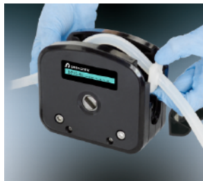
B. Put the tubing with cartridge or connector into pump housing.