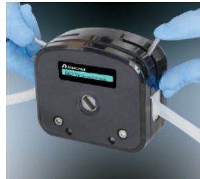
C. Install the upper block, put down the levers to lock the block.