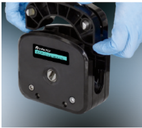
A. Lift both side levers, take off the upper block.