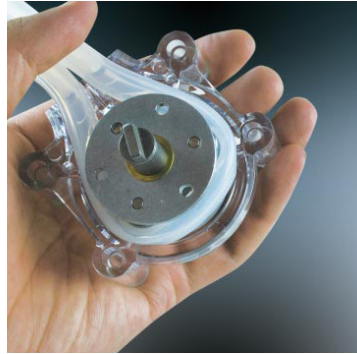
2. Make the tubing go around the rollers one cycle, and merge it on the exit.