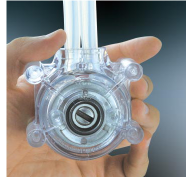
3. Tighten the tubing aptly, and load the other half pump head body.