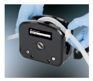
B. Put the tubing with cartridge or connector into pump housing.