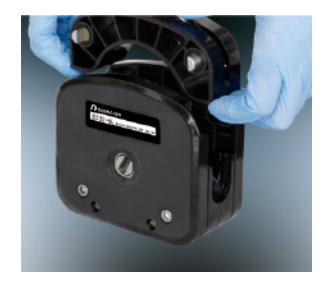
A. Lift both side levers, take off the upper block.