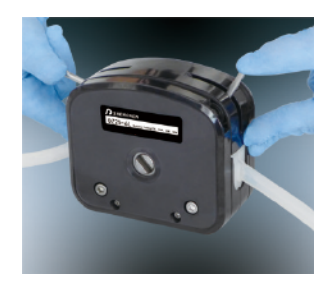
C. Install the upper block, put down the levers to lock the block.