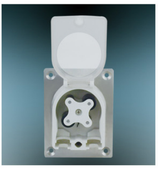
2. Open the transparent cover. 3. Install the tubing.