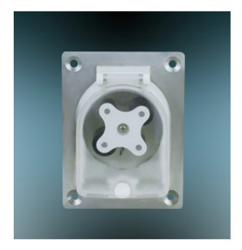
1. As below picture, turn the holding pin to unlocking position.