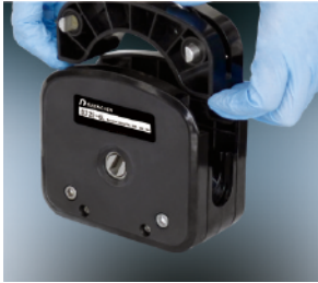
A. Lift both side levers, take off the upper block.