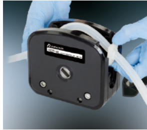
B. Put the tubing with cartridge or connector into pump housing.