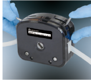
C. Install the upper block, put down the levers to lock the block.